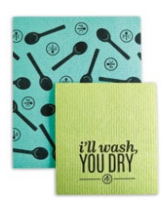
Everyday Cleaning Cloths $10.50 value