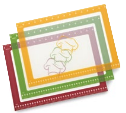
Flexible Cutting Mat Set $23.25 value